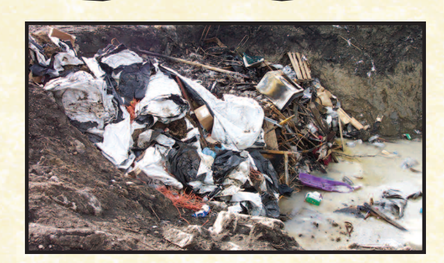
HOW CAN I HELP?

• When you see an illegal dump site, take a stand for your land.